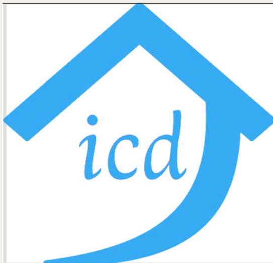
Asociația Institutul Pentru Creație și Dezvoltare – Romania