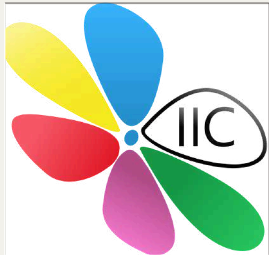
International Initiatives for Cooperation Bulgaria