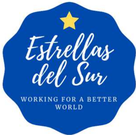
Estrellas del Sur – Spain