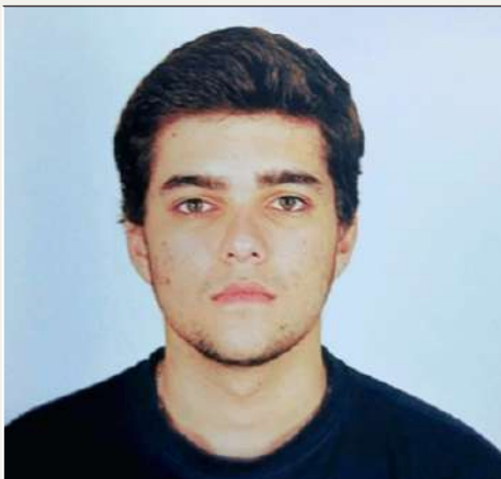
Diogo Soares Logistics